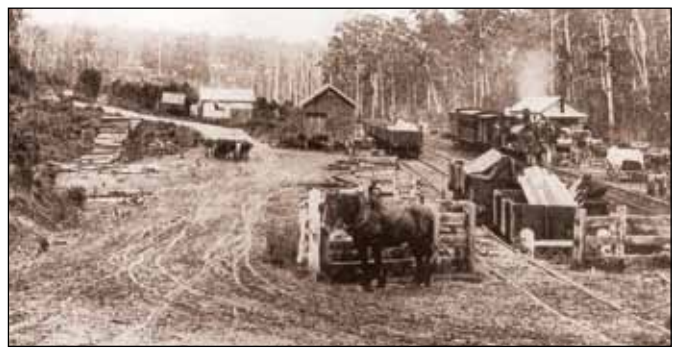
Timboon Station c1910 - Courtesy of Heytesbury Historical Society.

The Camperdown Timboon Rail Trail Steering Committee was established in 1994 and the Rail Trail was officially opened in 2009. It is owned by the Victorian Government (Department of Sustainability and Environment) and is currently managed by a government appointed Committee of Management.